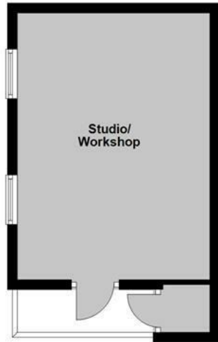
Ground Floor Main area: approx. 41.5 sq. metres (446.2 sq. feet) Plus outbuildings, approx. 24.4 sq. metres (262.9 sq. feet)